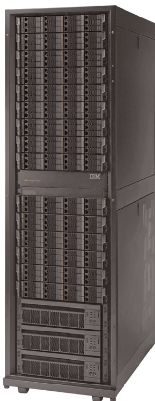
IBM XIV: Single-tier storage based on a scalable grid architecture

http://www-03.ibm.com/systems/storage/news/center/xiv/index.html