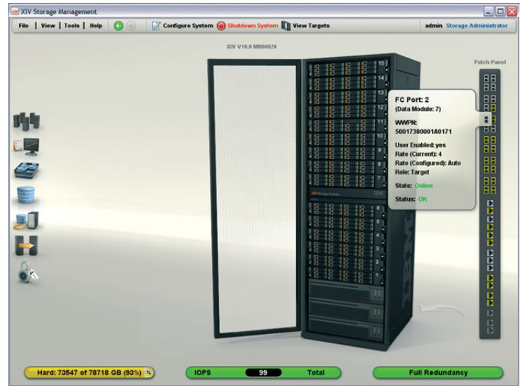
IBM XIV's intuitive GUI simplifies management